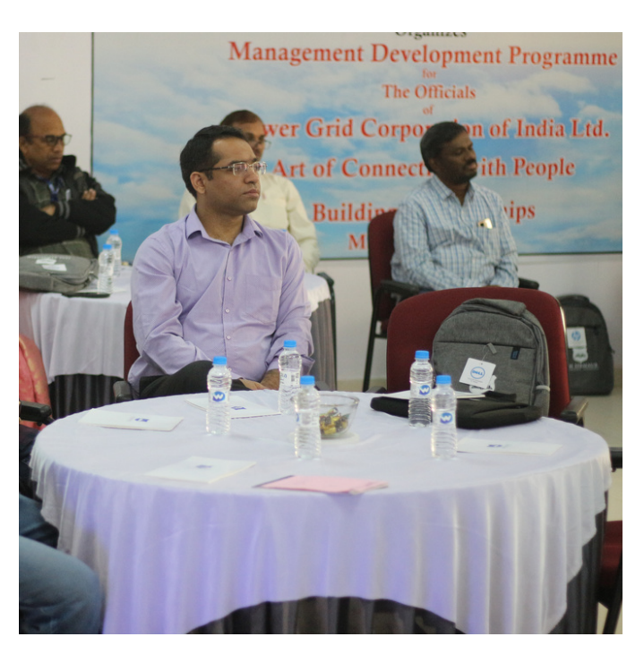
IIM Sirmaur MDP Experience